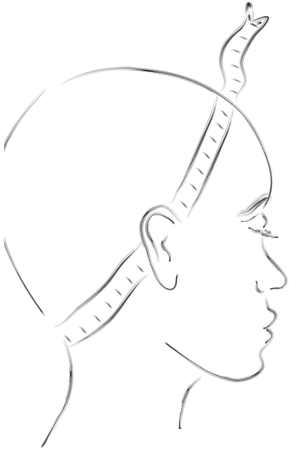
"A" This measurement is the circumference of the hairline, under the occipital bone at the back of the head.

Prep head as though you were going to wear a wig. Using a cloth measuring tape, like wardrobe people use, measure head carefully as shown below.